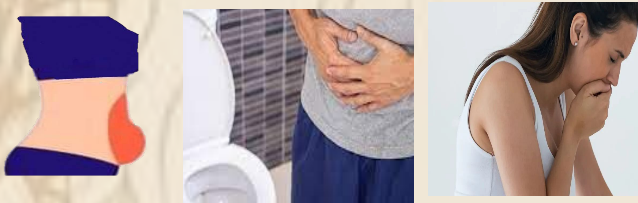
Gluten belly diarrhea Nausea