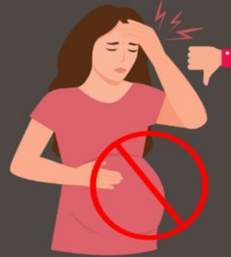
Un wanted Pregnancy