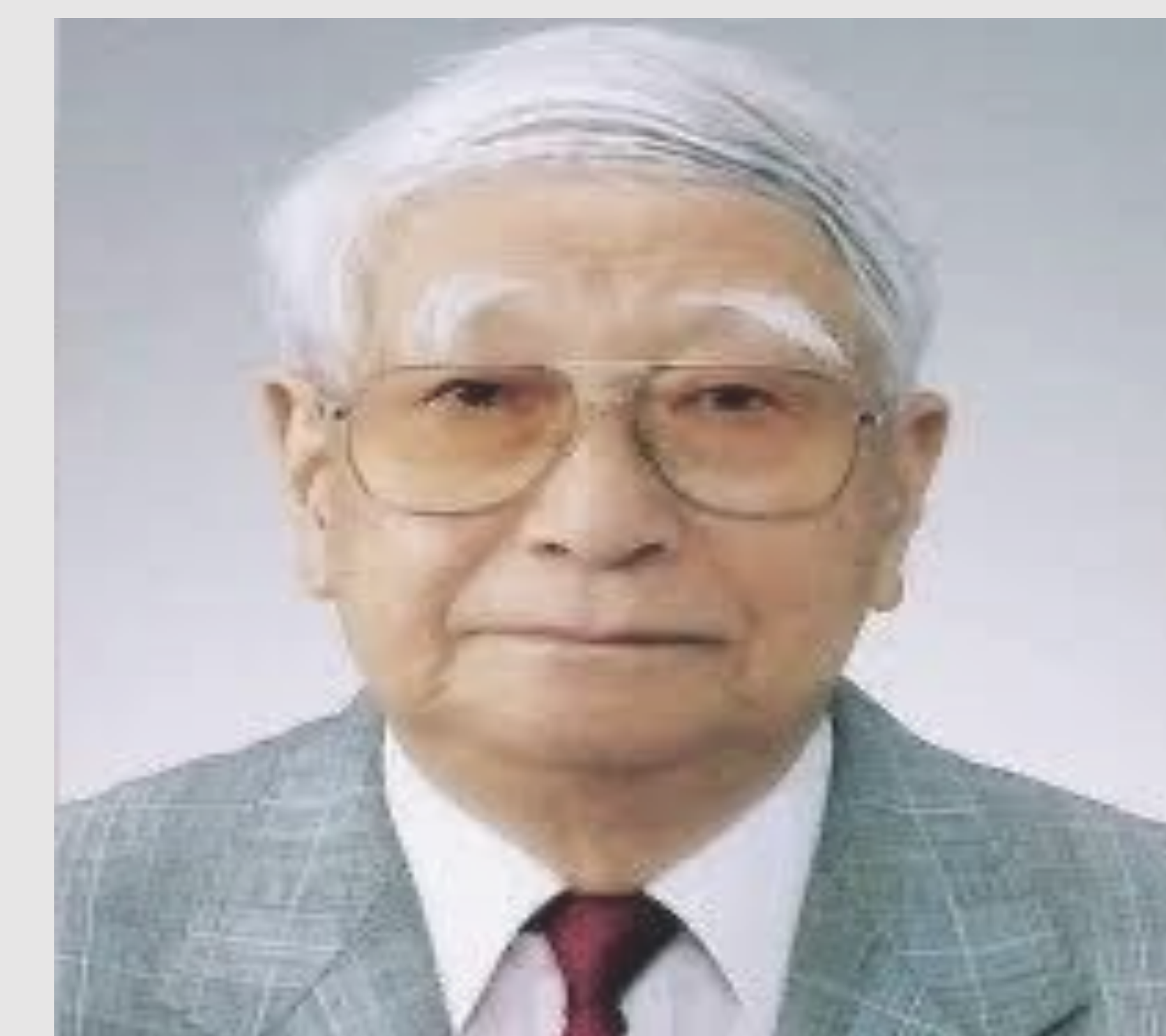
Dr: Tomasa Ku Kawasaki

Children, characterized by vasculitis. Kawasaki disease is a rare condition that affects young children. Symptoms include fever, swelling of the lymph nodes, a change in the color of the mouth and throat, and swelling of the hands and feet. It is usually treated with immune serums and aspirin to avoid complications, especially concerning the heart.