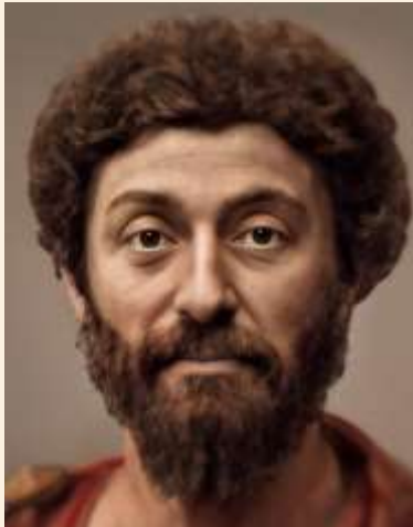
Robert Downey Jr.