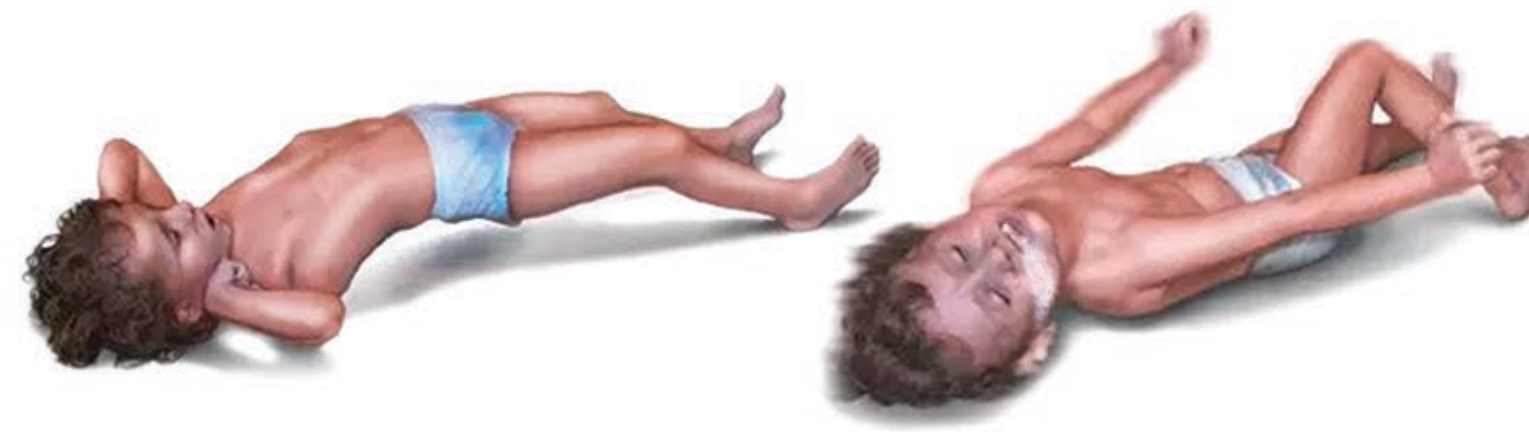
T-Health Topics-Epilepsy with Tonic-clonic Seizures. Qmedicinecoin. 2017. Available at .1 http://www.qmedicine.co.in/top%20health%20topics/T/Epilepsy%20with%20Tonic-clonic%20Seizures.html

Mildly exposed people usually recover completely. Severely exposed people are less likely to survive. (7)