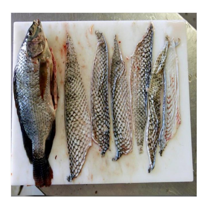
Figure 1 (3)

Nile tilapia fish or orechromis niloticus is a type of large genus of tilapia, and its exist in large amounts in African coasts and in Australia, the skin of tilapia is very helpful in treating skin burns its rich in type I and III collagen fibers which help in formation of scarring, reduces the pain, less expensive and promote tissue remodeling and take less time.(2)